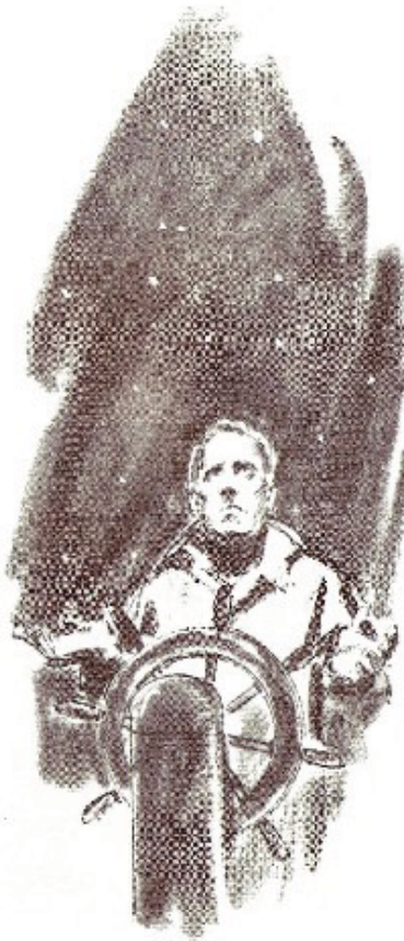
I let a Higher Power take over.

3 Made a decision to turn our will and our lives over to the care of God as we understood Him.