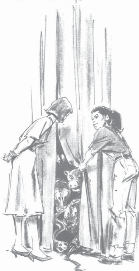
I admit all I did wrong.

5 Admitted to God, to ourselves and to another human being the exact nature of our wrongs.