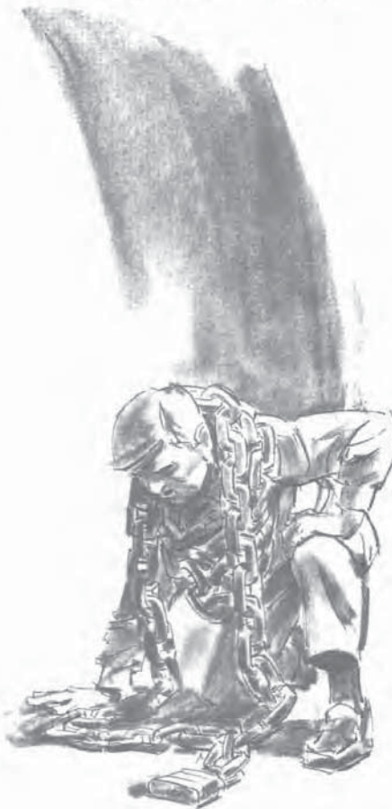
I want to be free.

6 Were entirely ready to have God remove all these defects of character.