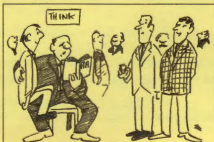
"It appears he's nearly ready to take his First Step."

Final responsibility and final authority for A.A. world services should always reside in the collective conscience of our whole Fellowship.